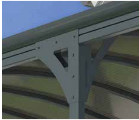
Sturdy & durable design