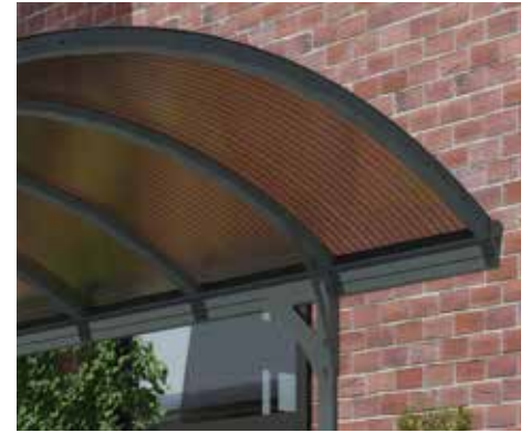
Fastening roof panel system